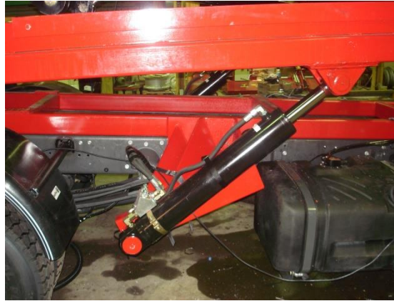
Tilt function 15 degrees