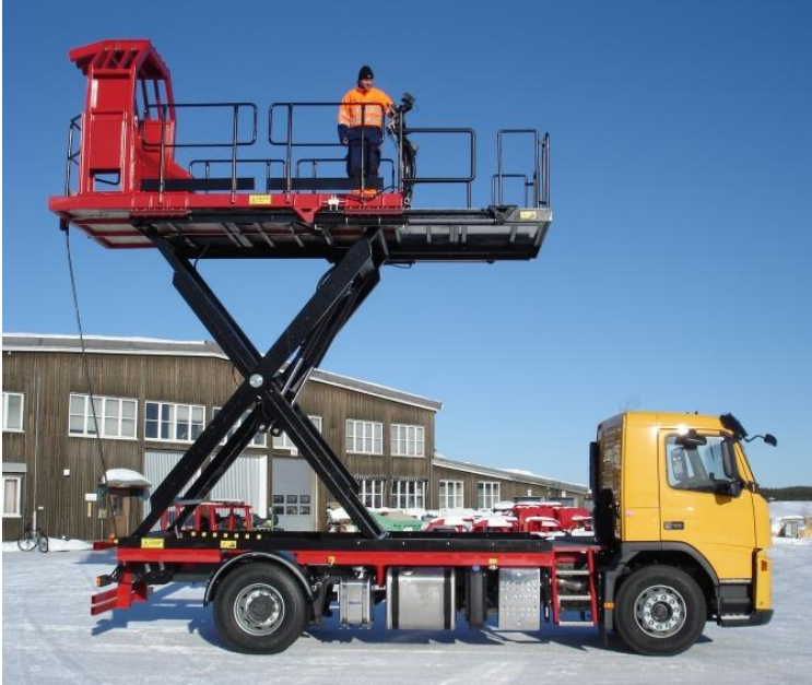
Carrier: Volvo FM