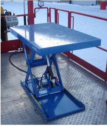
Extra scissor lift