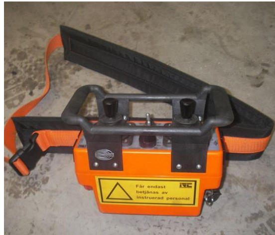
Radio control and ReCo-drive