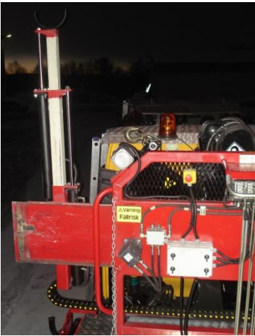
Hydraulic pipe lift