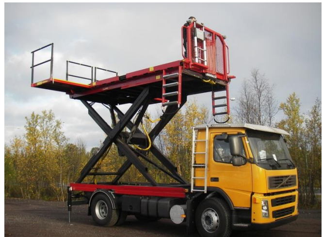
Carrier: Volvo FMX