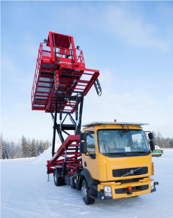
Carrier: Volvo FL 280